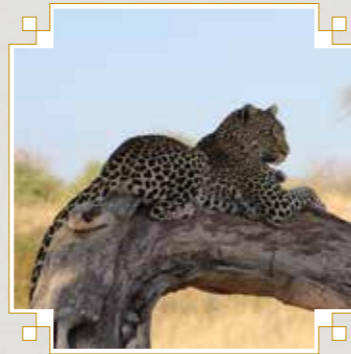
LEOPARD | CHUI