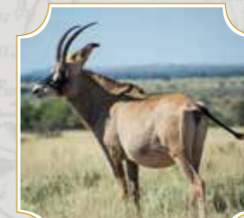
ROAN ANTELOPE | KORONGO