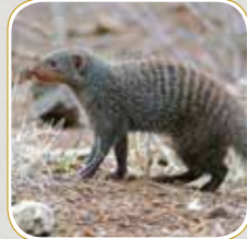
MONGOOSE | NGUCHIRO