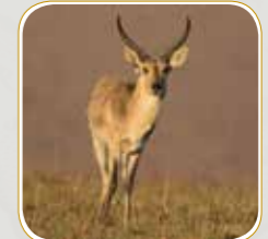
REEDBUCK | TOHE