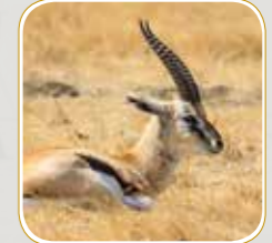
GRANT'S GAZELLE | SWALA GRANTI