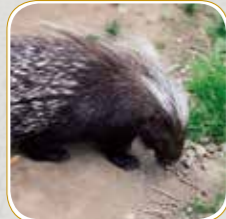
PORCUPINE | NUNGU-NUNGU