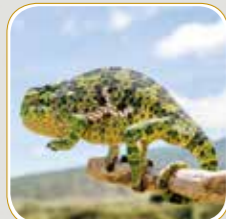
CHAMELEON | KINYONGA

THIS POSTER SHOWS SOME OF THE MAMMALS LIVING IN RUAHA NATIONAL PARK. EACH MAMMAL IS LABELLED WITH THE ENGLISH AND KISWAHILI NAME.