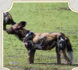
WILD DOG | MBWA MWITU