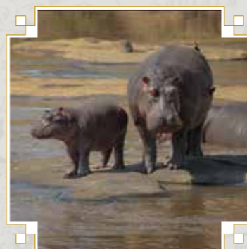
HIPPO | KIBOKO