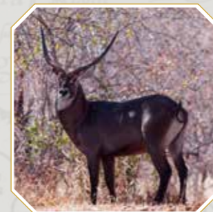
WATERBUCK | KURO