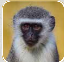
VERVET MONKEY | TUMBILI