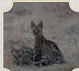
SERVAL CAT | MONDO