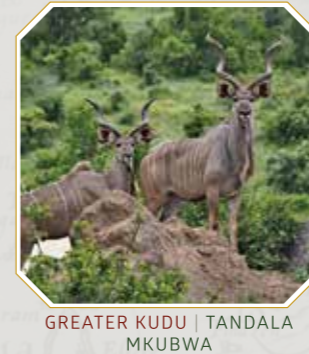
GREATER KUDU | TANDALA MKUBWA