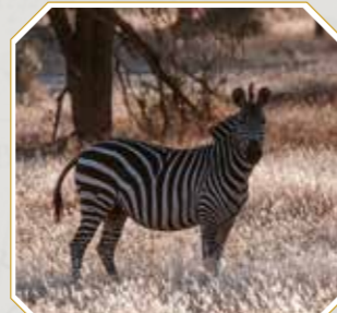
ZEBRA | PUNDA MILIA