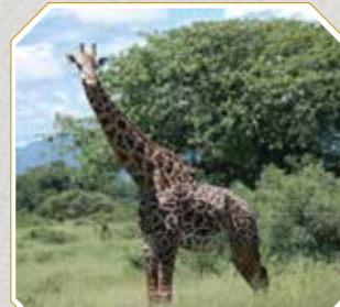
GIRAFFE | TWIGA