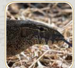
MONITOR LIZARD | KENGE