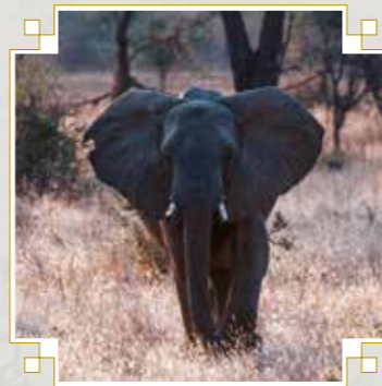
ELEPHANT | TEMBO