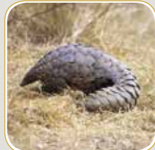
PANGOLIN | KAKAKUONA