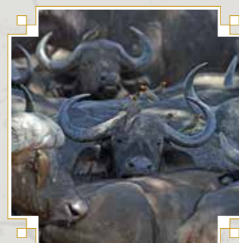
BUFFALO | NYATI