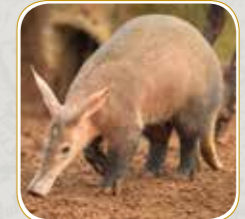
AARDVARK | MUHANGA