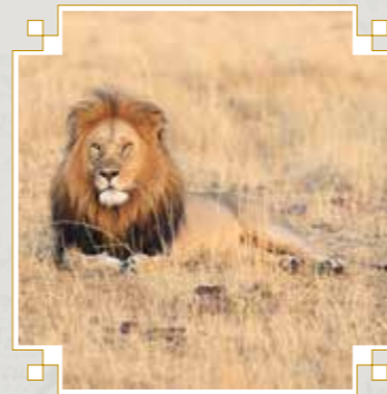
LION | SIMBA