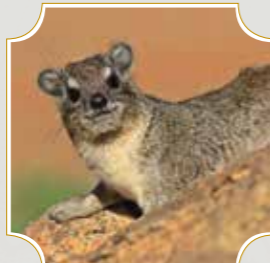
HYRAX | PIMBI