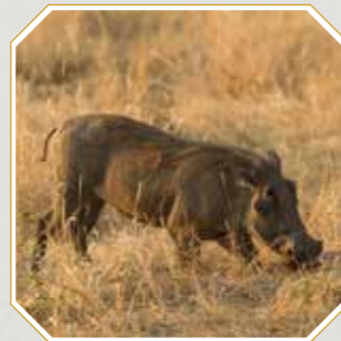
WARTHOG | NGIRI