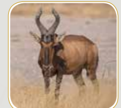
HARTEBEEST | KONGONI