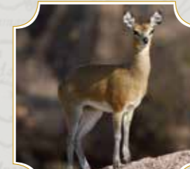
KLIPSPRINGER | MBUZI MAWE