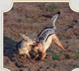
JACKAL | BWEHA