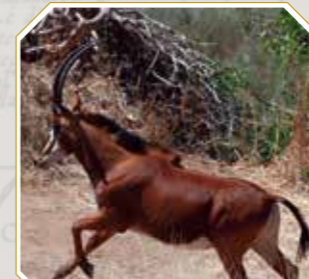
SABLE ANTELOPE | PALAHALA