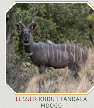
LESSER KUDU | TANDALA MDOGO