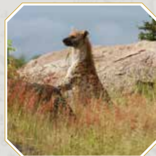
HYENA | FISI