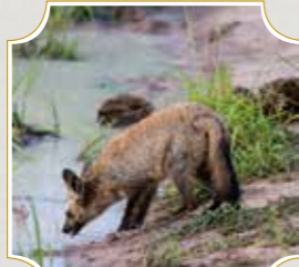
BAT EARED FOX | BWEHA MASIKIO