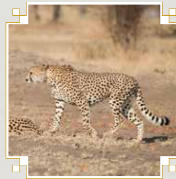
CHEETAH | DUMA