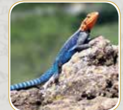
AGAMA LIZARD | MJUSI KAFIRI