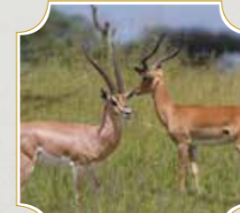
IMPALA | SWALA PALA