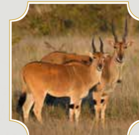
ELAND | POFU